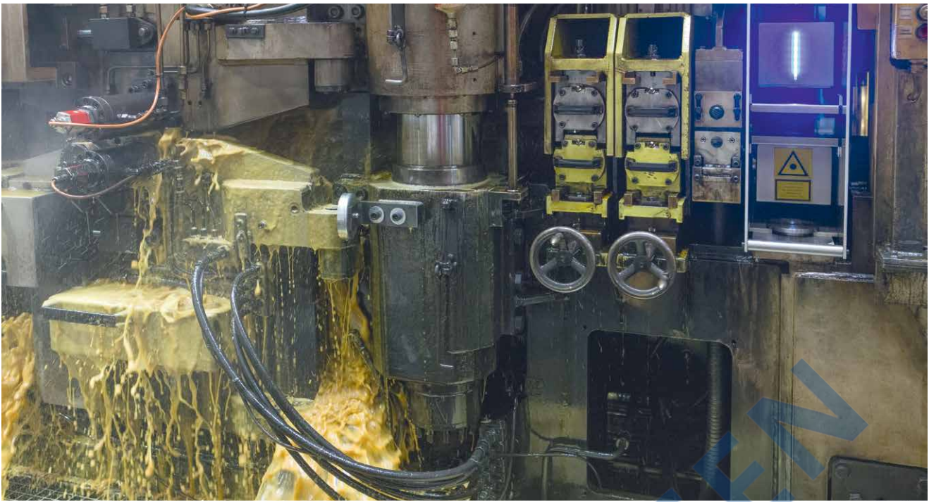
Only 200 mm length are required for the installation of the thickness measuring system

precision. The VTLG thus opens up completely new possibilities for quick and precise thickness control and for quality assurance. With an internal scanning rate of 50 kHz, the scalable analogue output provides the input signal for high-speed thickness control within milliseconds.